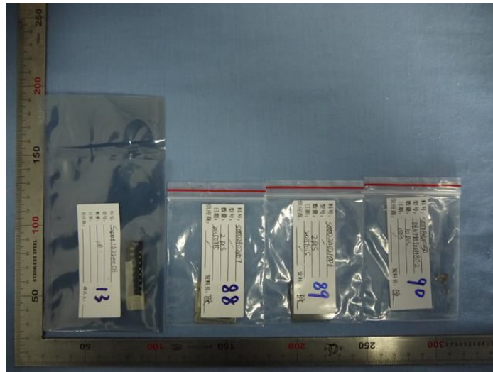
Photo 1 Wireless Module Metal Part