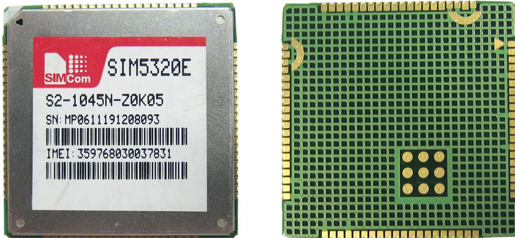
Photo 1 The sample of SIM5320E