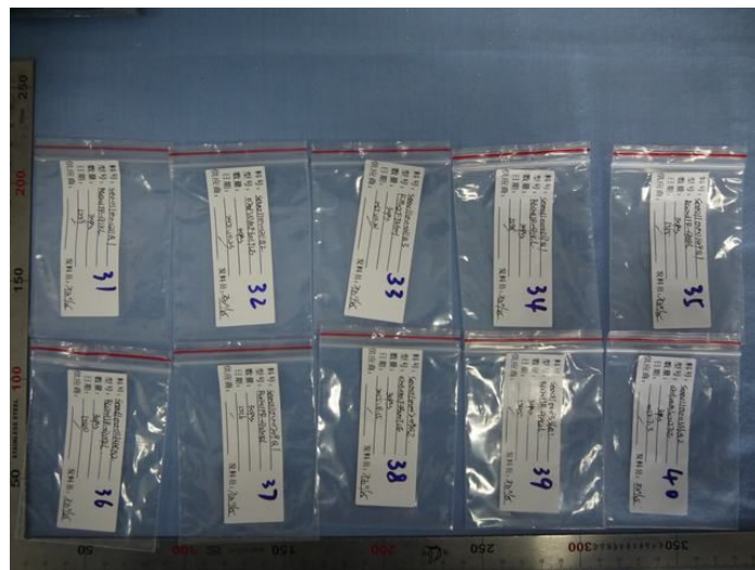
Photo 5 Wireless Module non-Metal Part-4