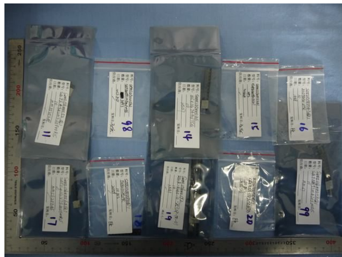
Photo 3 Wireless Module non-Metal Part-2