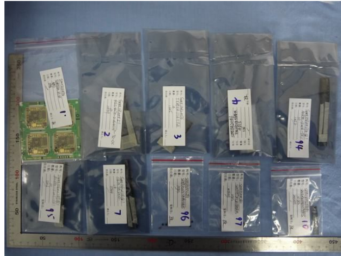
Photo 2 Wireless Module non-Metal Part-1