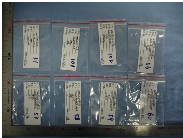
Photo 7 Wireless Module non-Metal Part-6