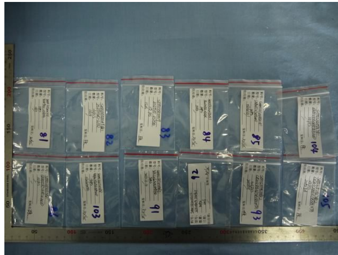
Photo 10 Wireless Module non-Metal Part-9